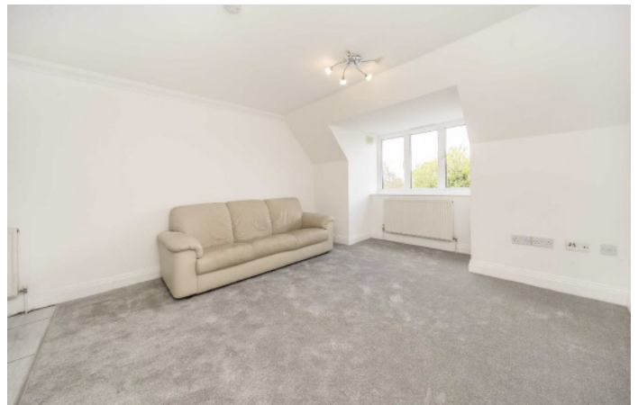
Station Road, NW4