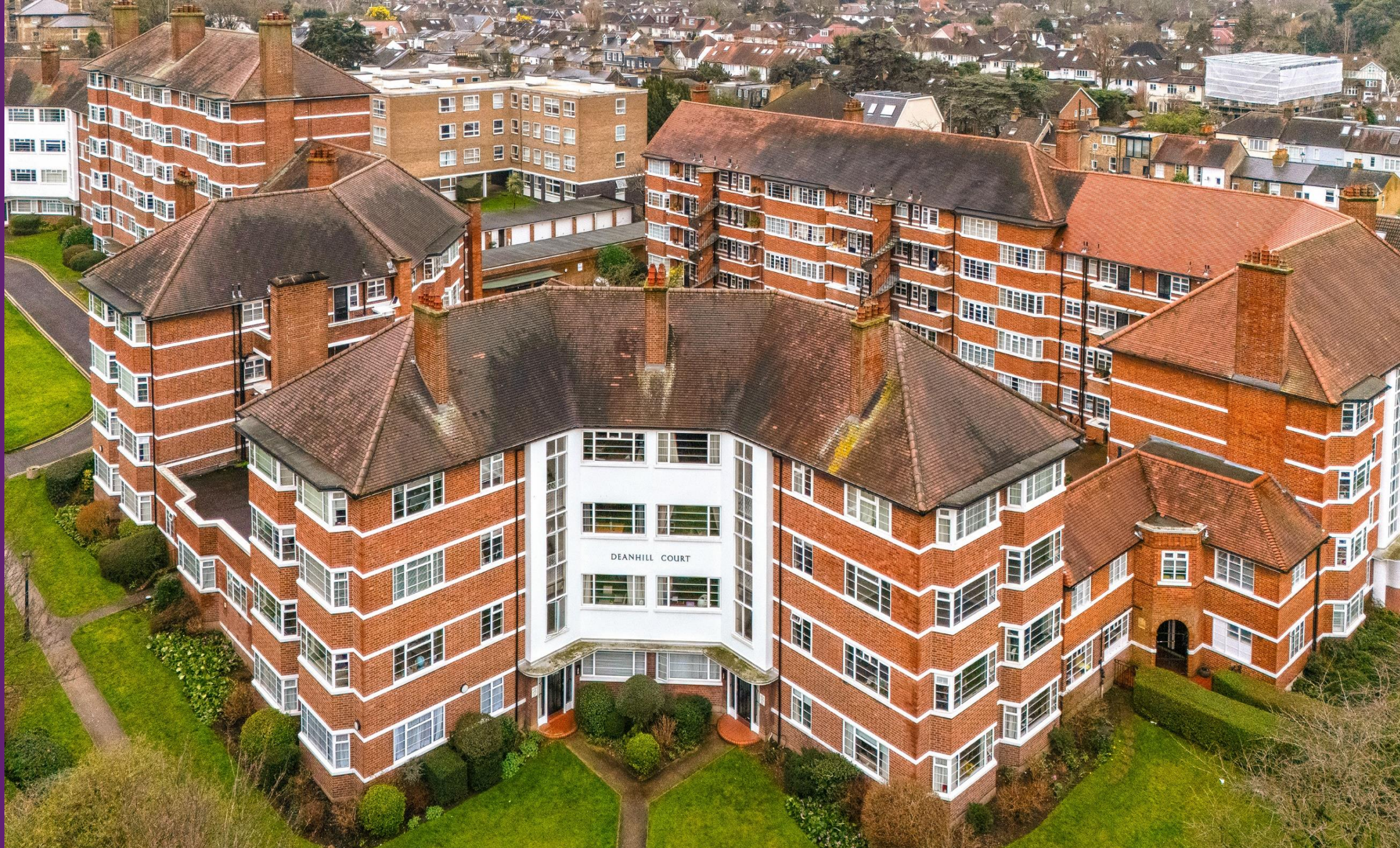
Deanhill Court Upper Richmond Road West, SW14