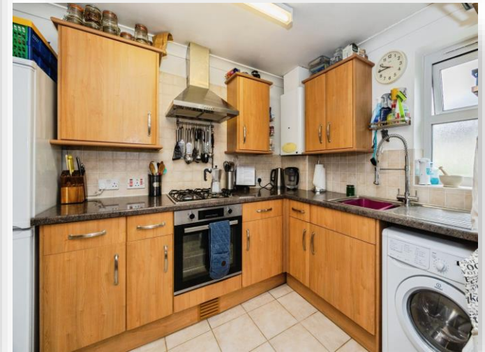
Cherry Tree Apartments, Hambledon Road, Waterlooville PO7 6UP