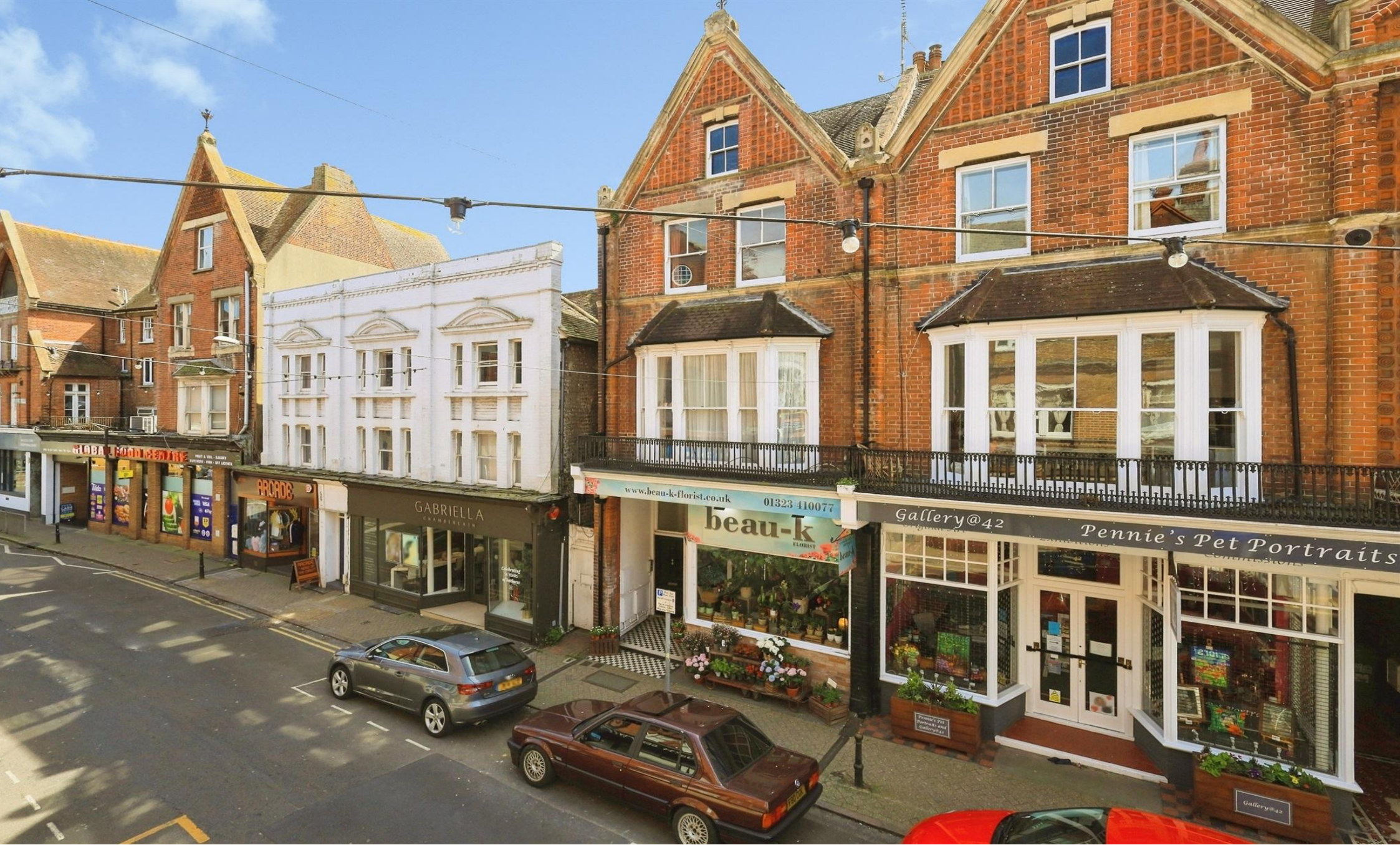
South Street, Eastbourne BN21 4XB