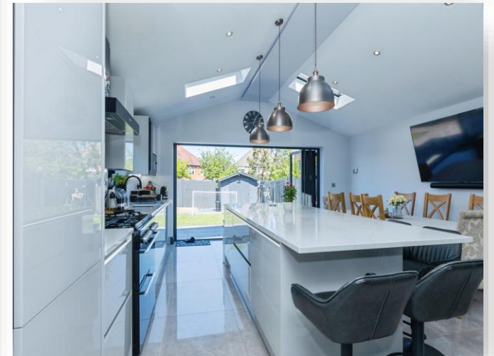
Scraptoft Lane, Leicester LE5 1PB