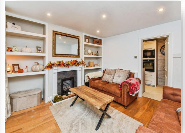
Paradise Lane, Rowde Devizes SN10 2NN