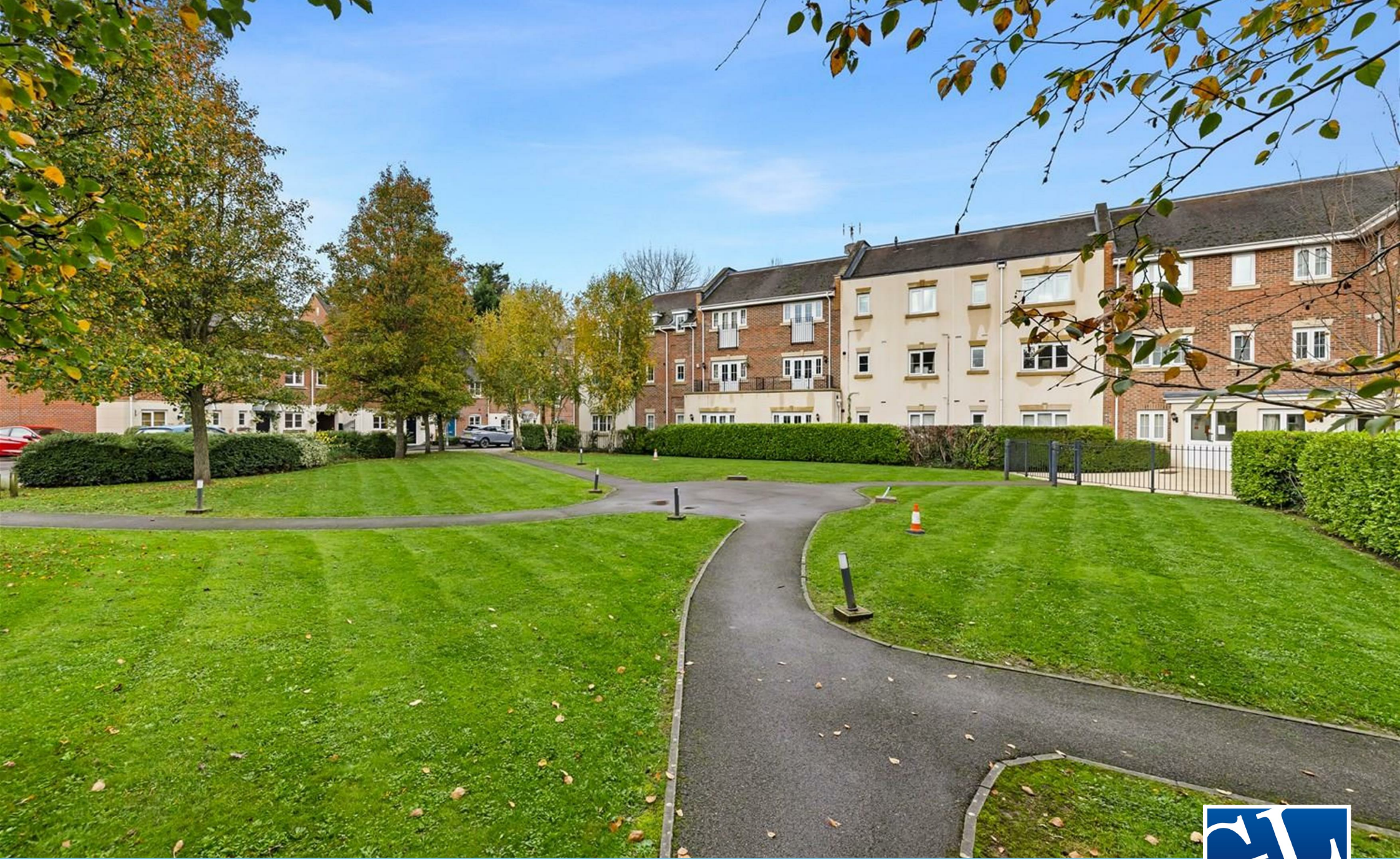
6 Wey House, Spiro Close, Pulborough, West Sussex RH20 1FE