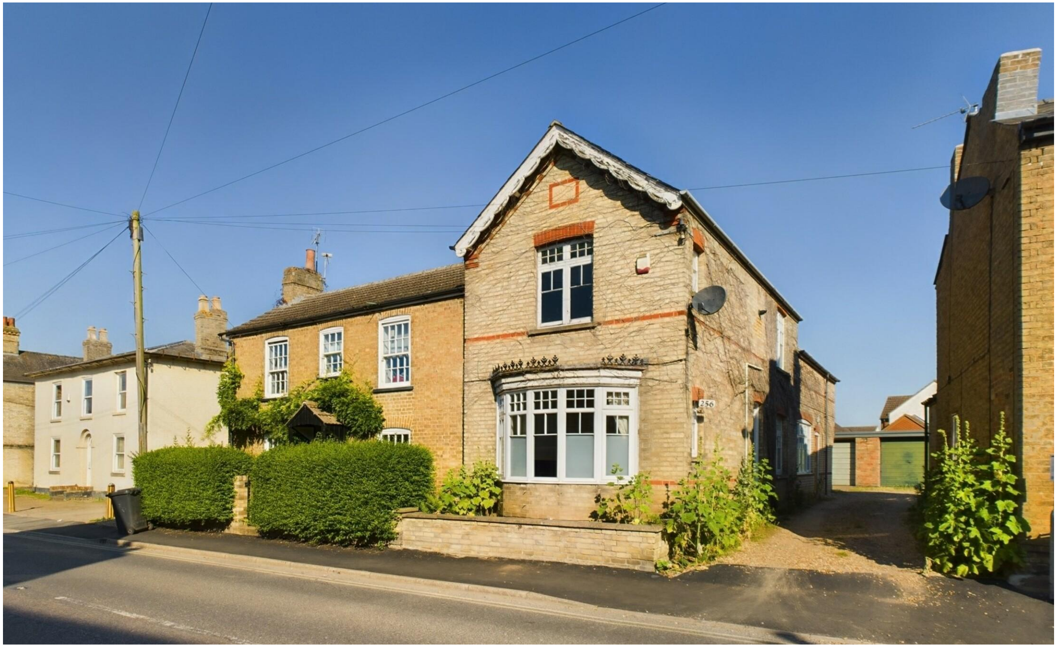
High Street, Cottenham