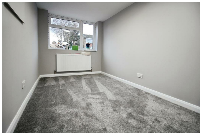
Bedroom 4 12'4" x 7'1" (3.76m x 2.16m)