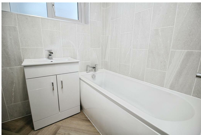
Bathroom 7'7" x 5'4" (2.32 x 1.63)