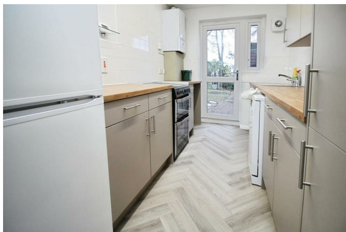
Kitchen 11'8" x 6'9" (3.56 x 2.06 )