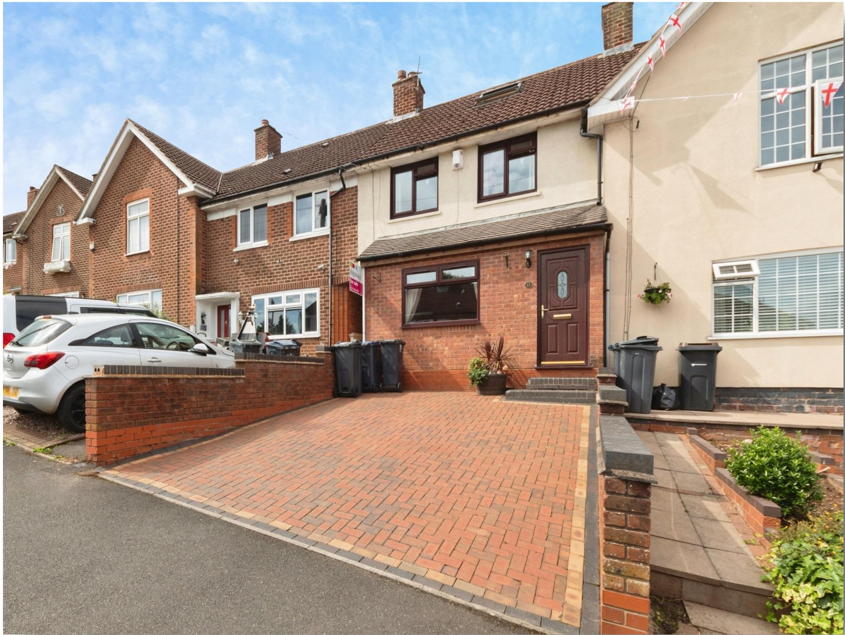
Ibberton Road, Birmingham B14 4SA