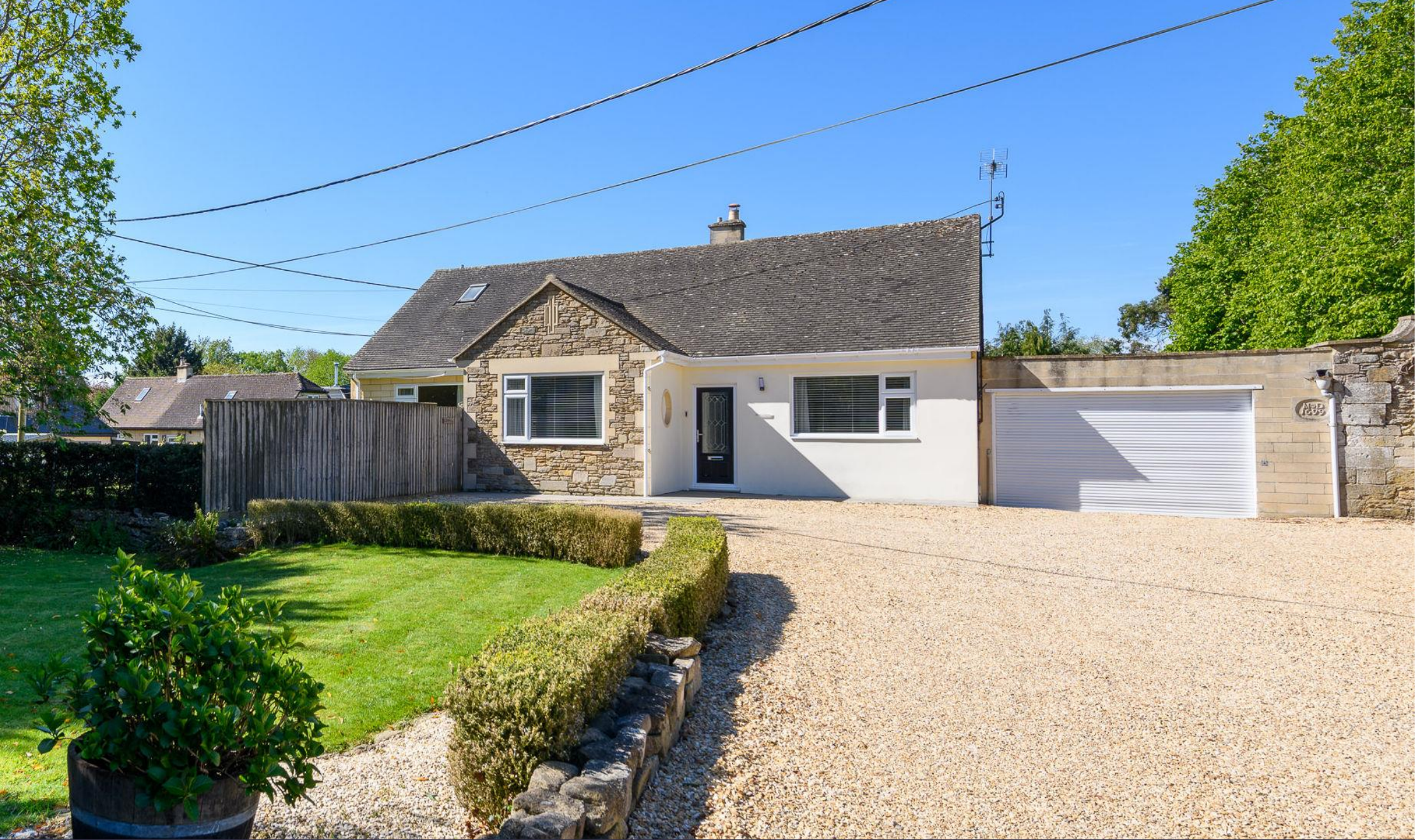
Cherrymead, Northleigh Bradford on Avon, Wiltshire, BA15 2RG