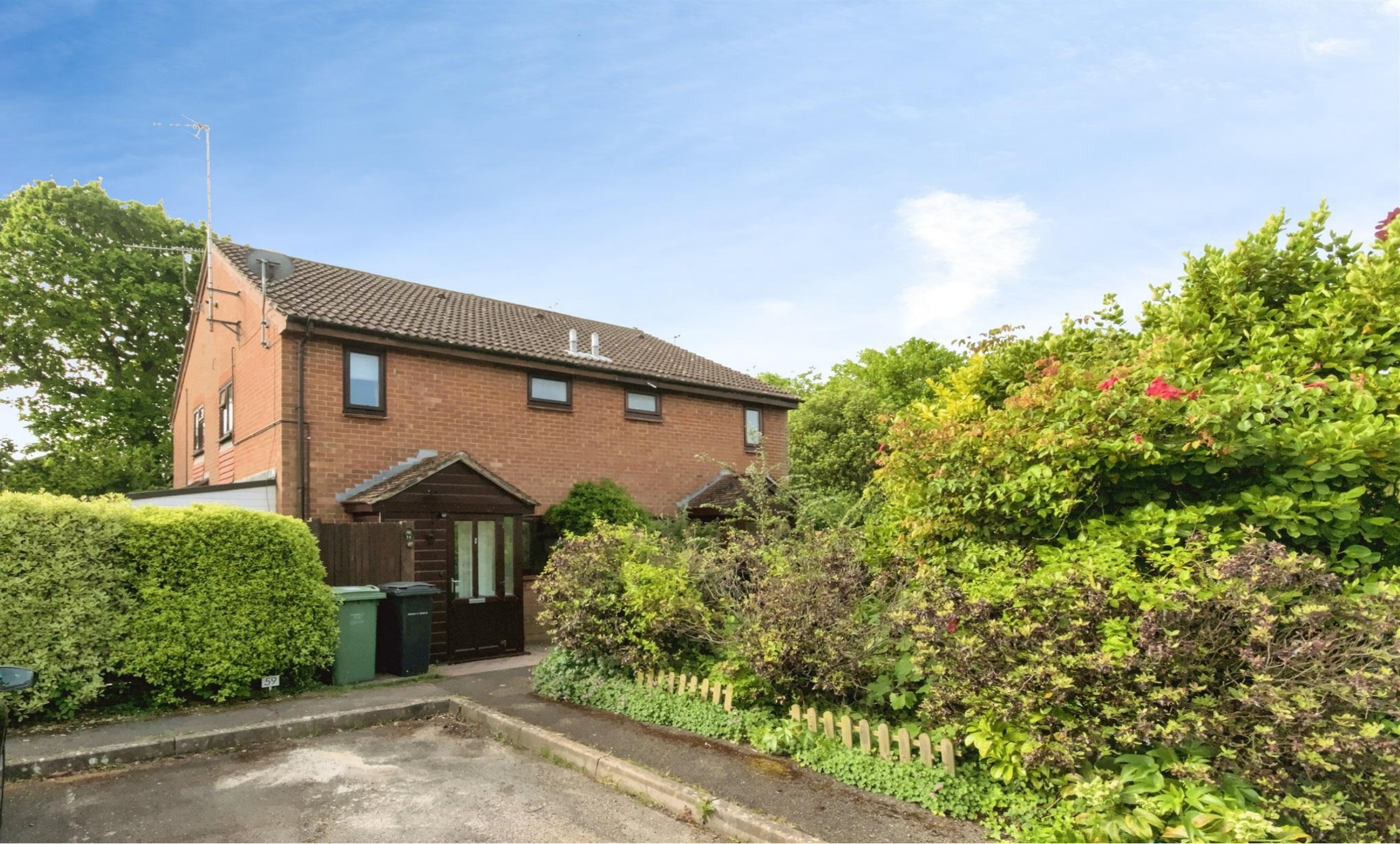
The Briary, Bexhill-On-Sea TN40 2ET