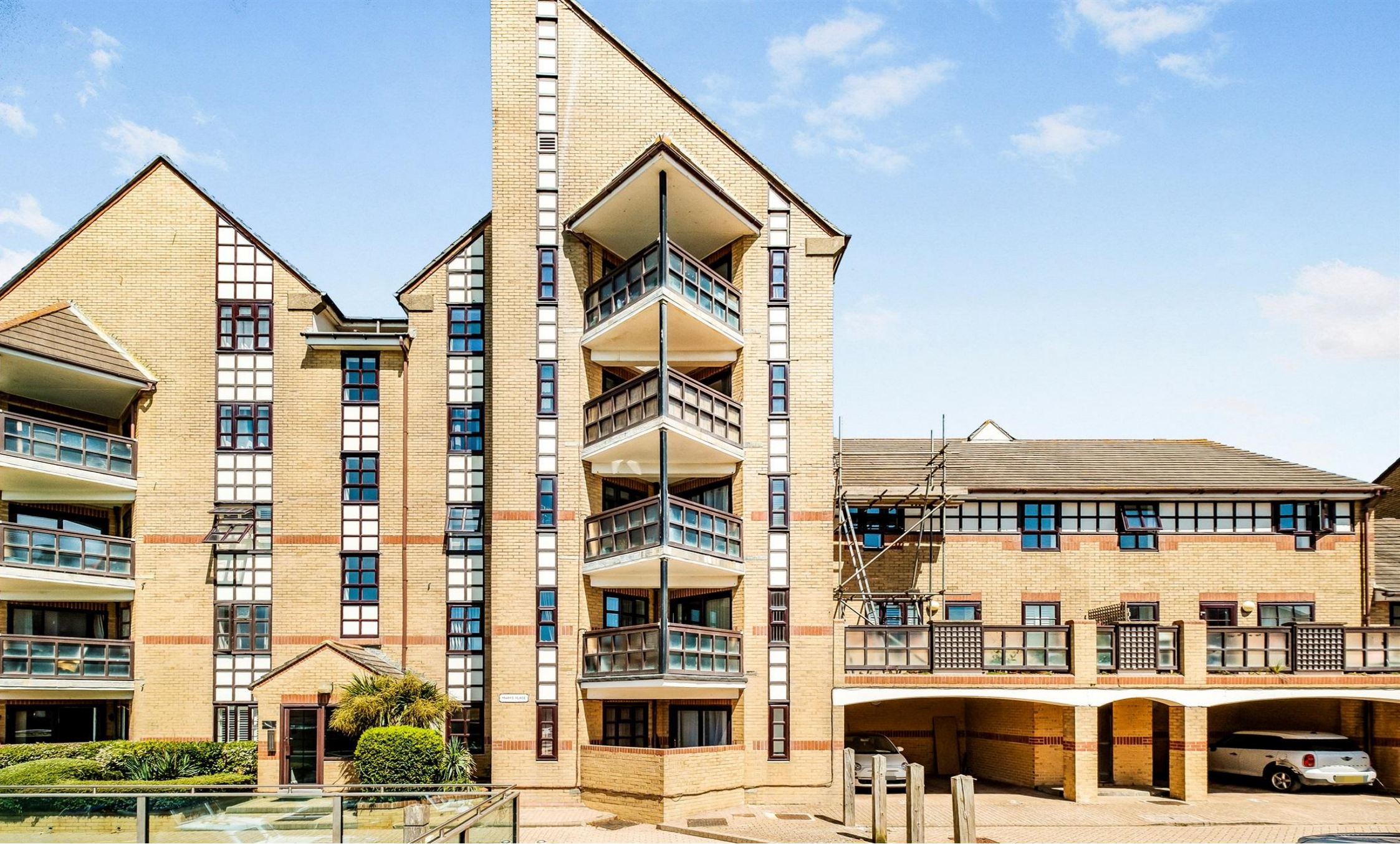
Marys Place Emerald Quay, SHOREHAM-BY-SEA BN43 5JS