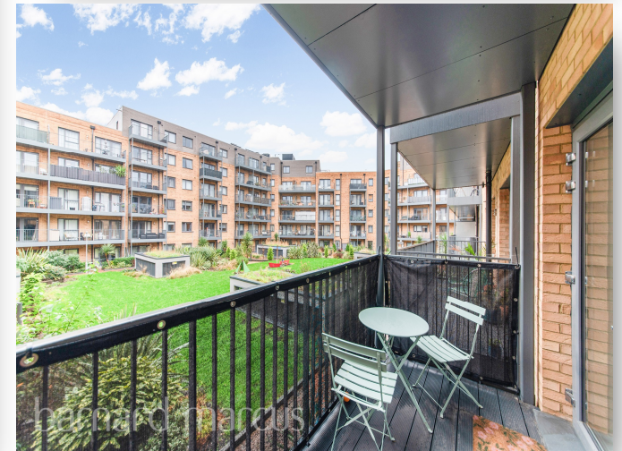
Pitsford House, St. Johns Road, New Malden, KT3 3FG