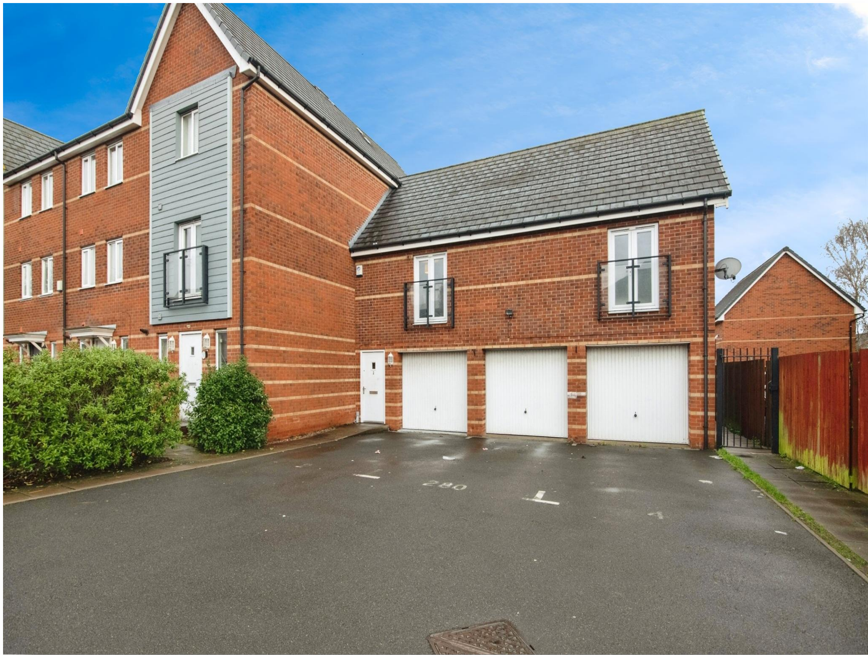
Caledon Street, Walsall WS2 9HT