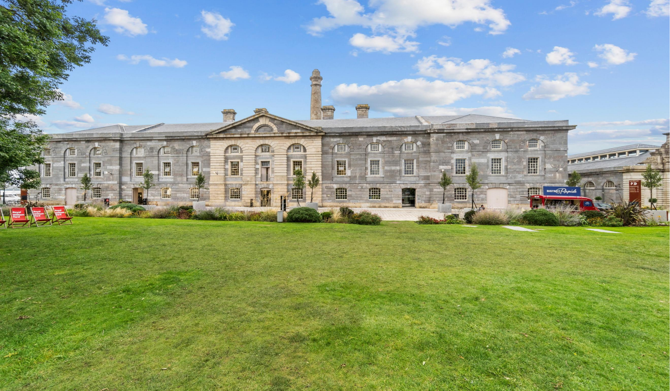
Flat 17 Mills Bakery, 4 Royal William Yard, Stonehouse, Plymouth, Devon, PL1 3GD