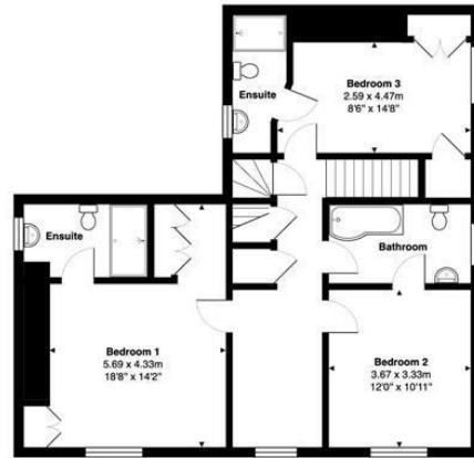
First Floor Area: 83.5 m 2 ... 898 ft 2