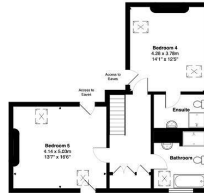
Second Floor Area: 60.0 m 2 ... 646 ft 2