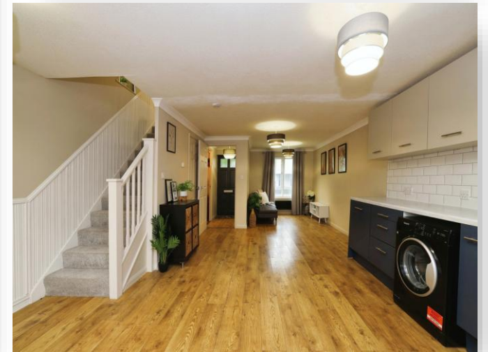
Carnegie Mews New Road, Calne SN11 0SQ