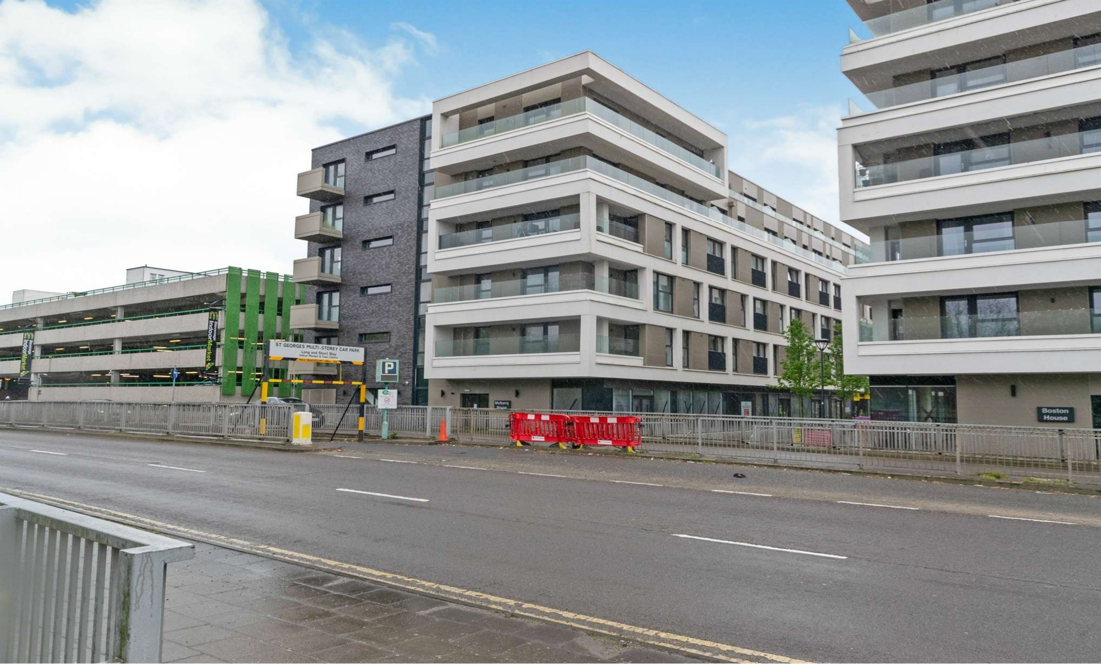
Mulberry House, Park Place, Stevenage, SG1 1BH