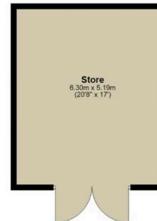
Outbuilding Approx. 32.7 sq. metres (351.9 sq. feet)