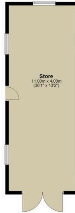
Outbuilding Approx. 44.0 sq. metres (473.8 sq. feet)