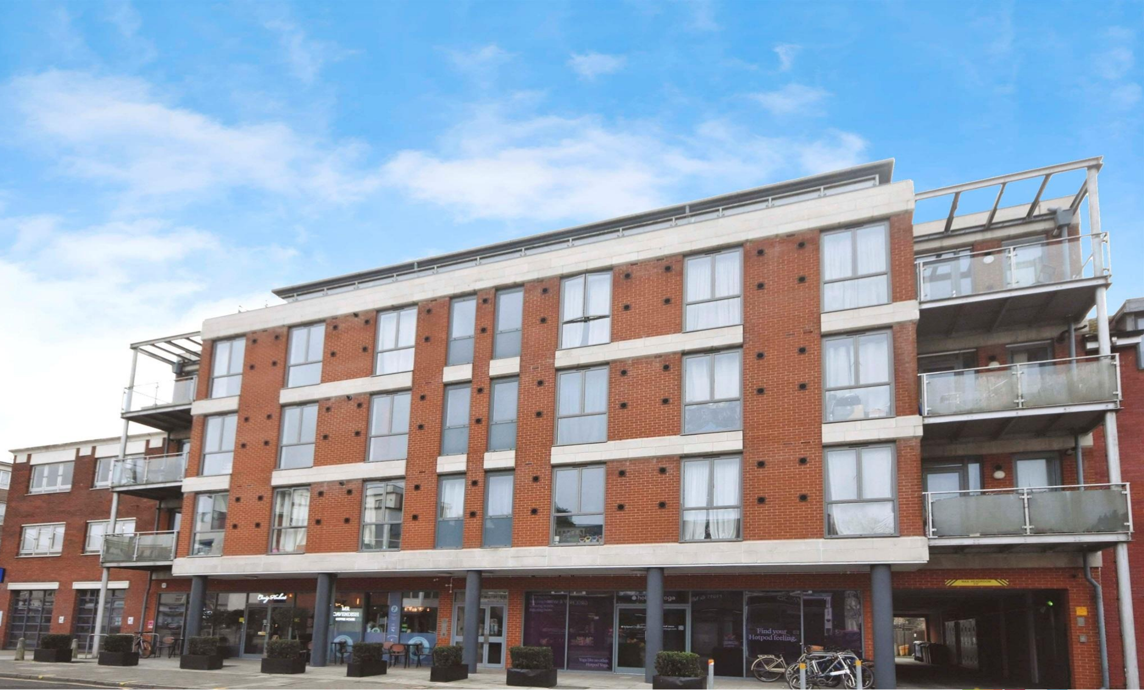
Lesley Court, Rainsford Road, Chelmsford CM1 2WS