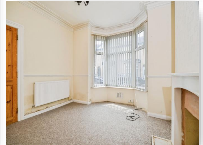
Hampton Road, Stockton-On-Tees TS18 4DU