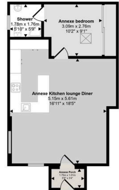
Annexe Approx 49 sq m / 532 sq ft

This floorplan is only for illustrative purposes and is not to scale. Measurements of rooms, doors, windows, and any items are approximate and no responsibility is taken for any error, omission or mis-statement. Icons of items such as bathroom suites are representations only and may not look like the real items. Made with Made Snappy 360.