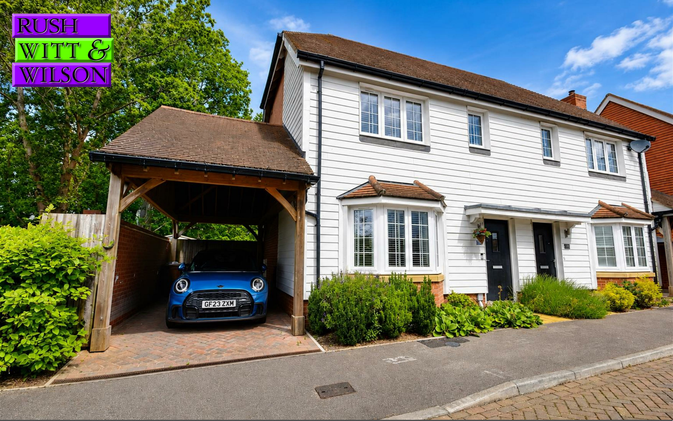
18 Woodham Close, Hawkhurst, Kent, TN18 5AQ. £395,000 Freehold