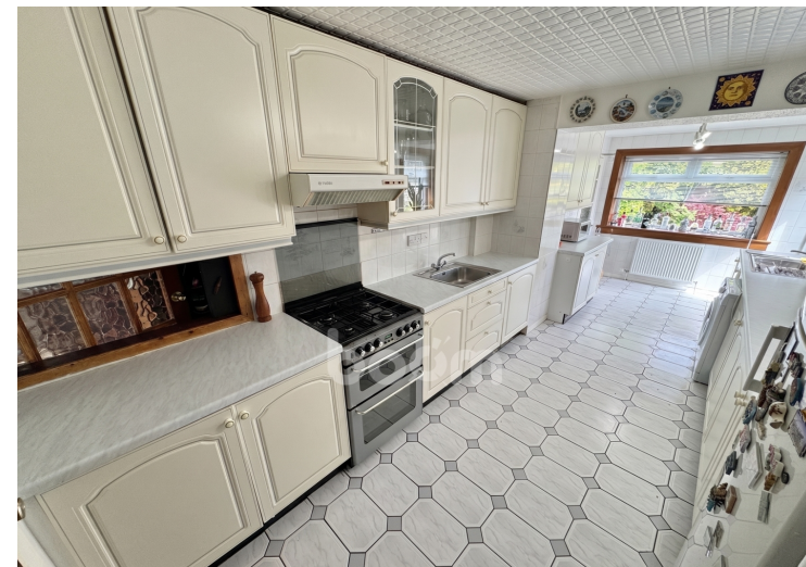
Antonine Road, Bearsden