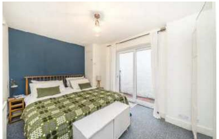
Eglinton Hill, SE18