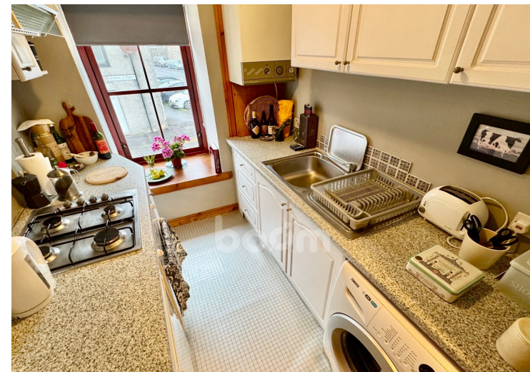
Avenue Square, Stewarton