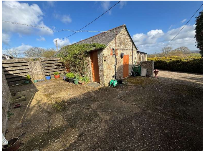
FRONT GARDEN AND REAR COURTYARD WITH STONE OUTBUILDING