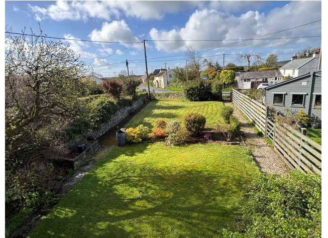
OVERVIEW OF SOUTH FACING GARDEN