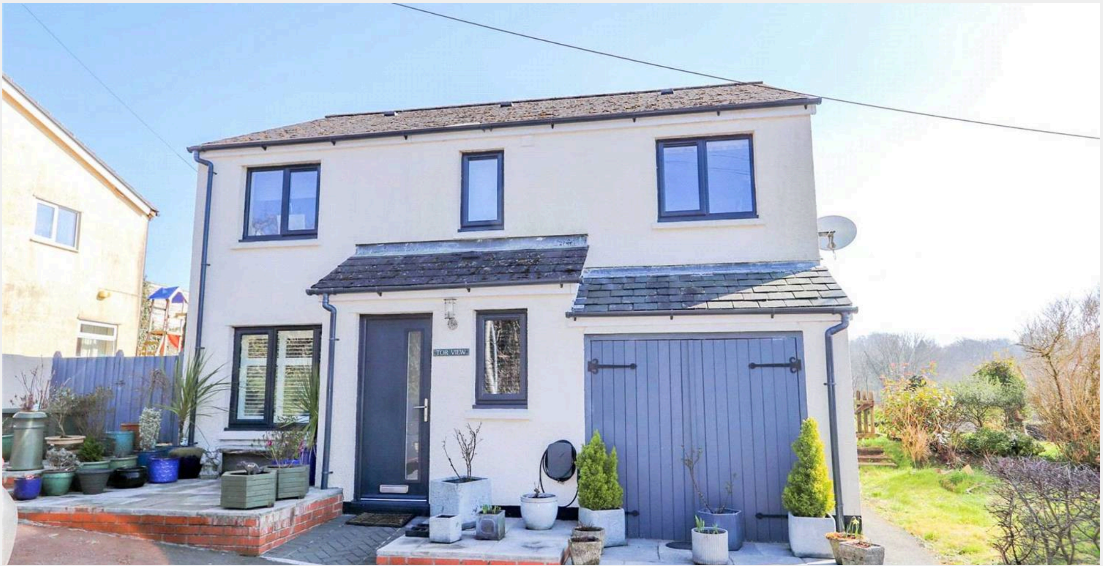
Tor View Pool Hill, Bridestowe Okehampton