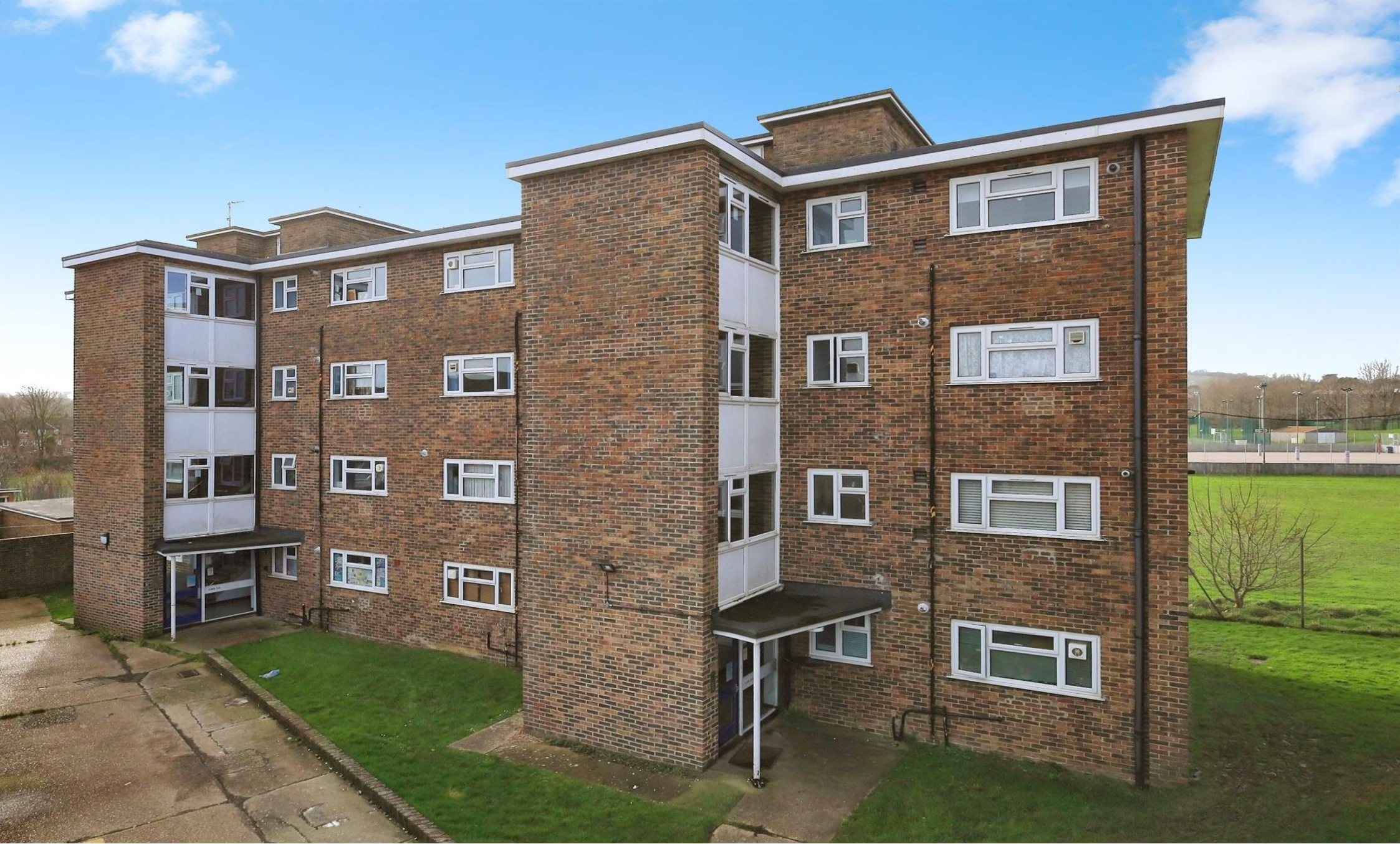
Argyll Court Faygate Road, Eastbourne BN22 9RP