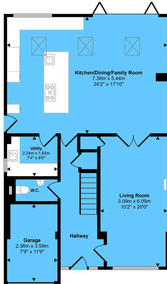
Ground Floor Approx 88 sq m / 950 sq ft

Approx Gross Internal Area 142 sq m / 1531 sq ft