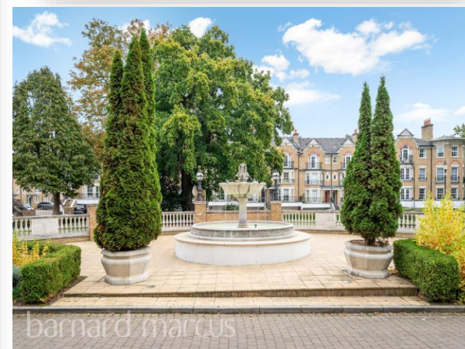
Chapman Square, Wimbledon Parkside, London SW19 5QR