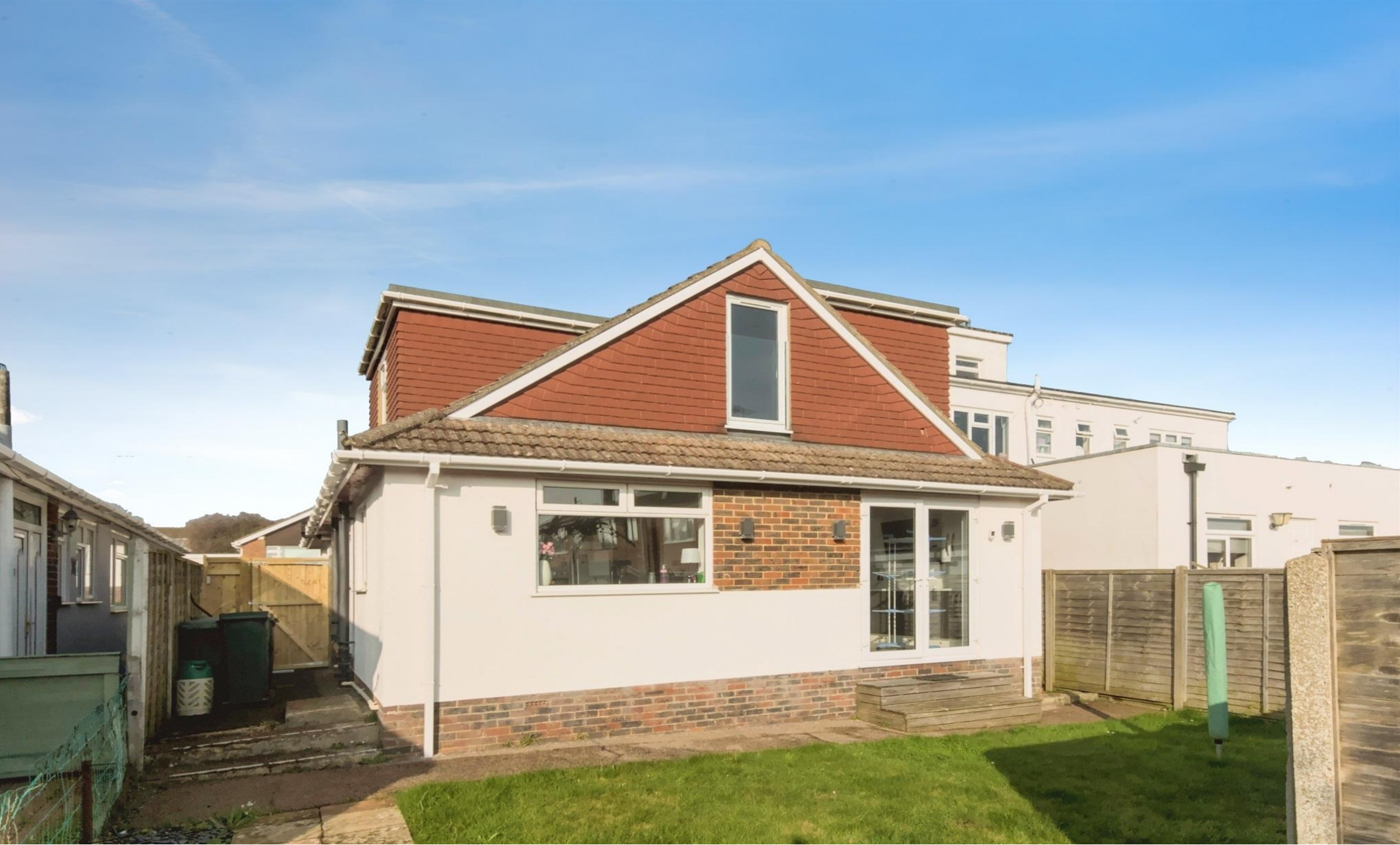
Firle Road, Peacehaven BN10 8DB