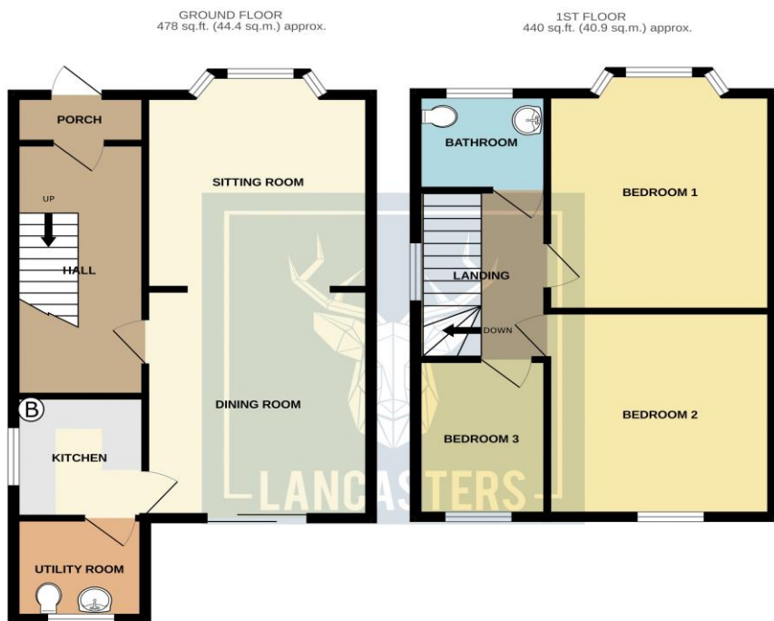
GROUND FLOOR 478 sq.ft. (44.4 sq.m.) approx.