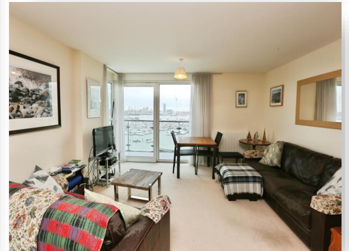
Harlequin Court, Rope Quays, Gosport PO12 1EQ