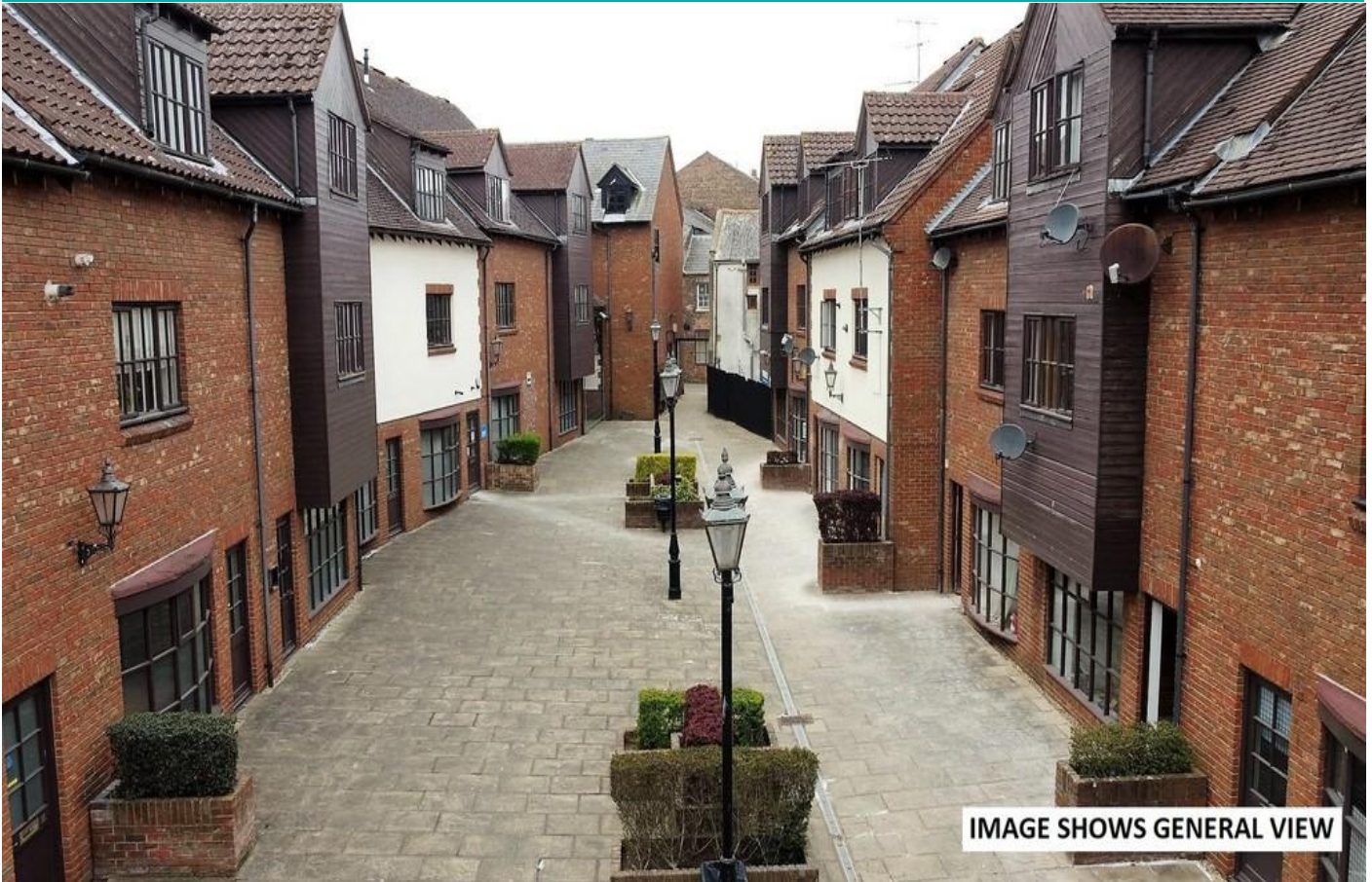
IMAGE SHOWS GENERAL VIEW