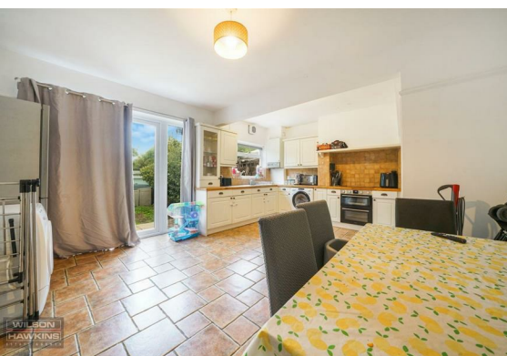
Council Tax Band E