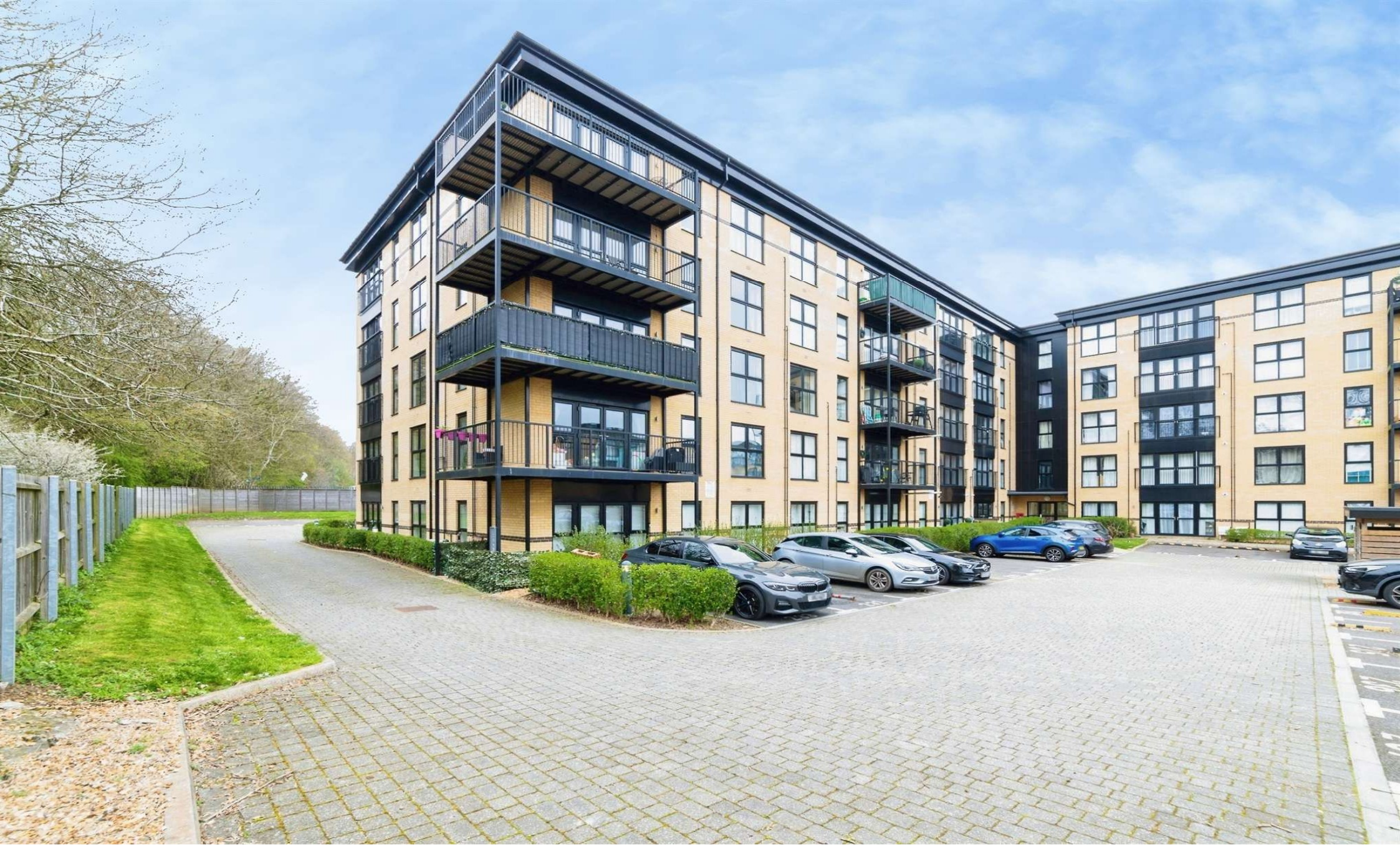
Shapiro House Giles Crescent, Stevenage SG1 4GW