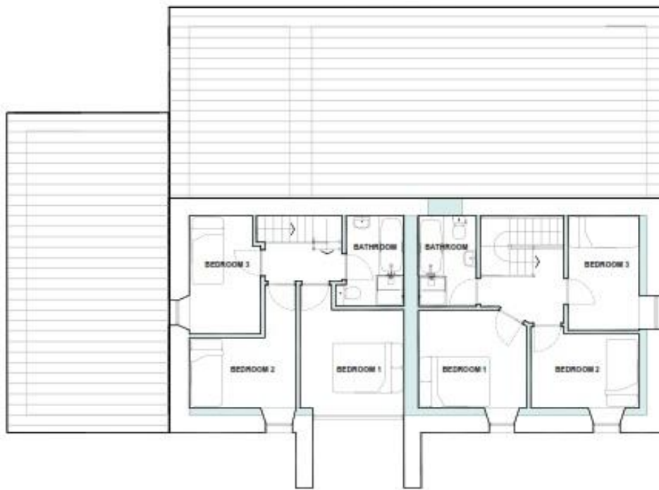
FIRST FLOOR PLAN - 1:100