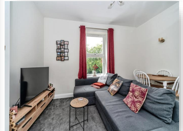
Ashburnham Road, BEDFORD, MK40 1EA