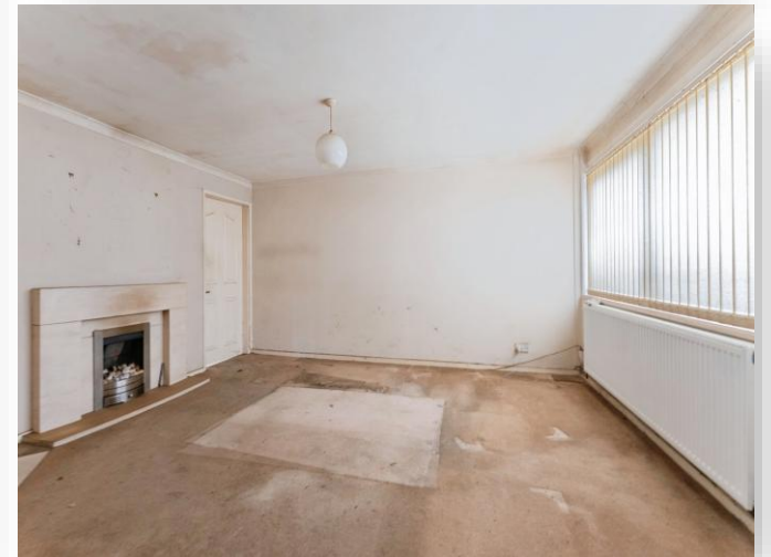
Torridon Grove, Great Sutton Ellesmere Port CH66 2UB