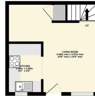
1ST FLOOR 19.9 sq.m. (214 sq.ft.) approx.