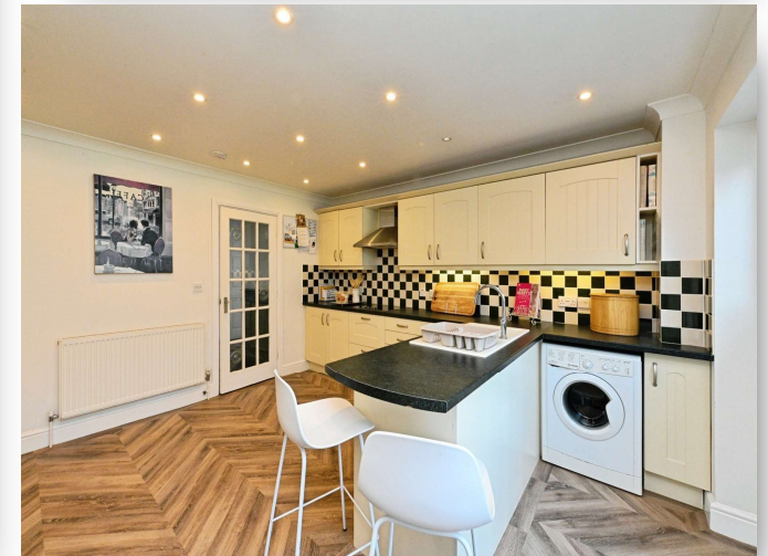
Redlands Court, Heacham, PE31 7TF