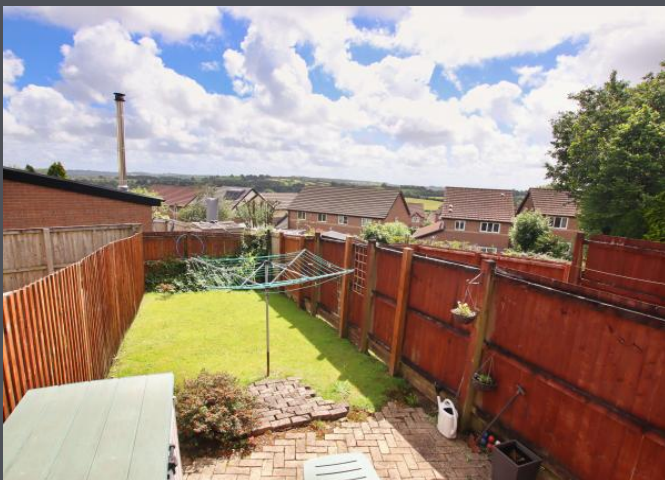
11 Pen Bryn Hendy, Miskin CF72 8QX