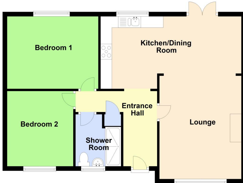
Ground Floor Approx. 71.0 sq. metres (764.6 sq. feet)