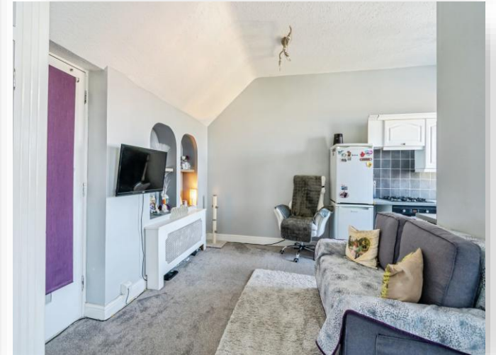
Streete Court Victoria Drive, Bognor Regis PO21 2RL