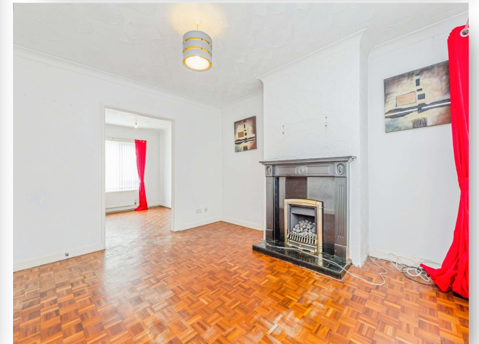
Ael-Y-Bryn, Llanedeyrn Cardiff CF23 9LL