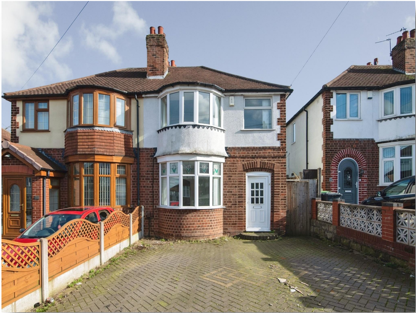
Regent Road, Tividale OLDBURY B69 1TL