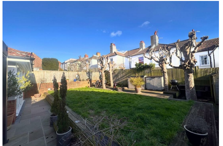
House - Detached (EPC Rating: B)