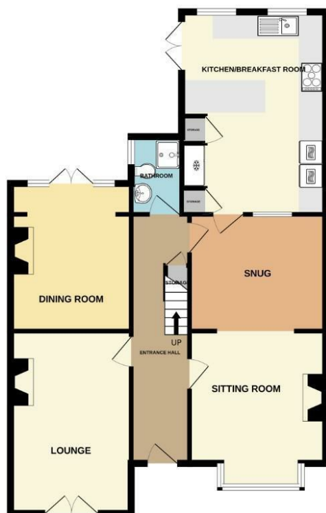
GROUND FLOOR 856 sq.ft. approx.