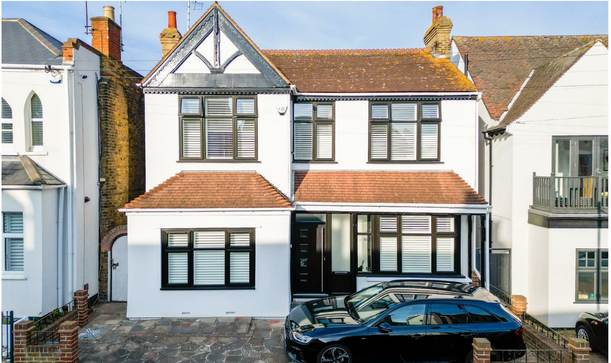
Cliff Road, Leigh-On-Sea £900,000